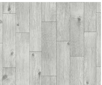
HARLAND 60 mil