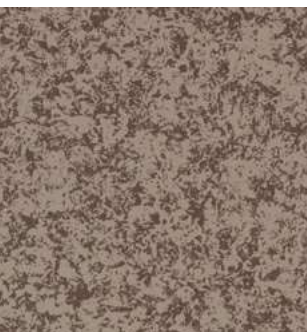
BRONZE 60 mil/80 mil