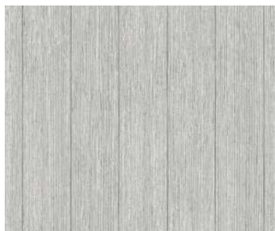
GRAFTON 60 mil