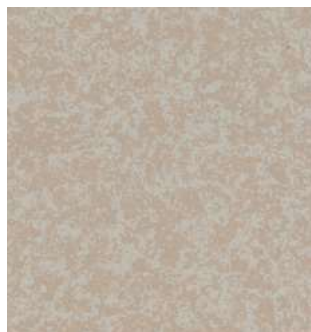
BRICK 60 mil/80 mil