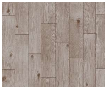
ROWAN 60 mil