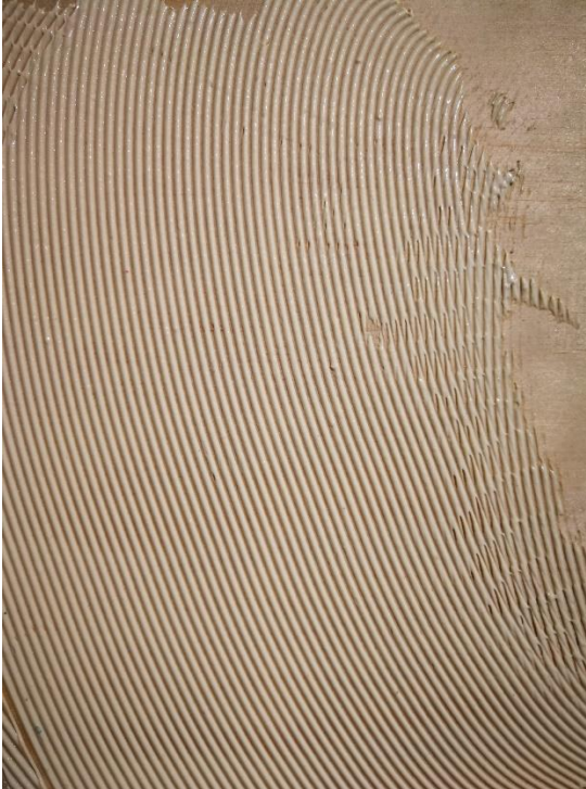
Current WBA 100 formulation