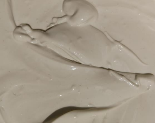
New WBA 100 formulation