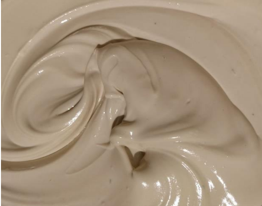
Current WBA 100 formulation