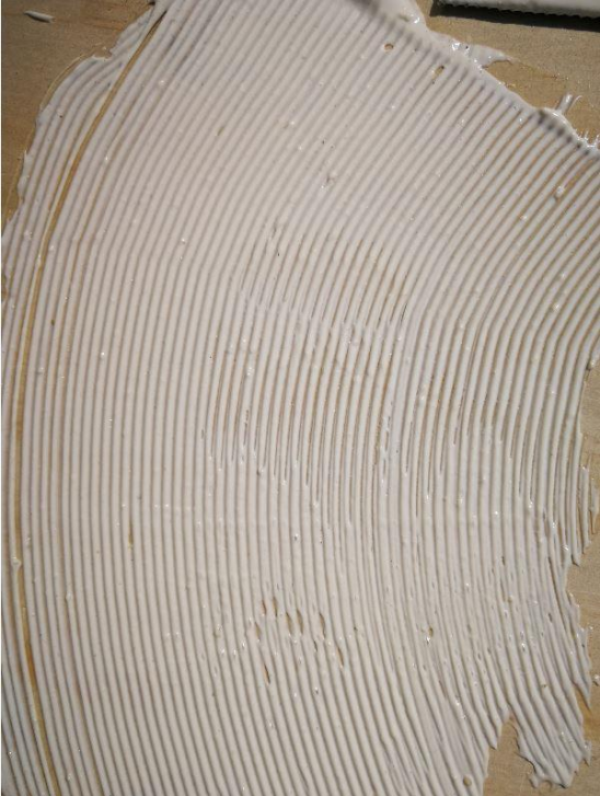
New WBA 100 formulation