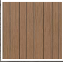
KWILA 60 mil