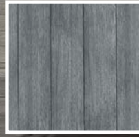
CLASSIC GREY 60 mil/80 mil