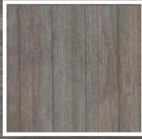
WEATHERED OAK 60 mil/80 mil