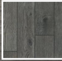
OXIDIZED OAK 60 mil